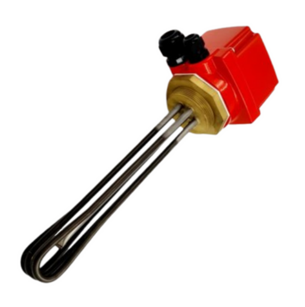
HRi Heavy Duty Immersion Heater