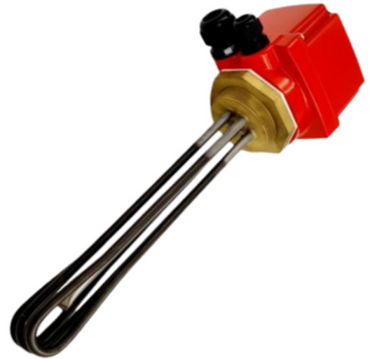
HRI Heavy Duty Immersion Heater

* also available for chemical and oil applications (please contact us for recommendations)