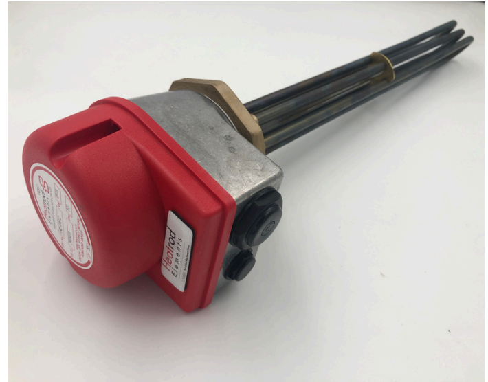
HRZ Light Industrial Titanium Immersion Heater