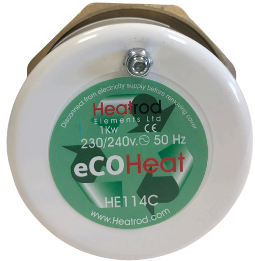
eCo Heat low wattage immersion heater

Bespoke designed eCo Heat immersion heaters available on request. Please do not hesitate to contact us.